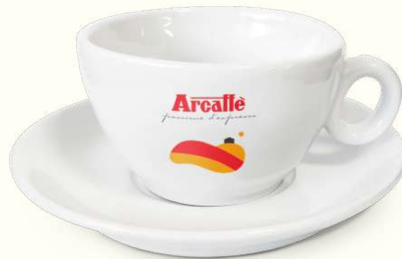
Caffelatte cup & saucer (290cc) JA1301