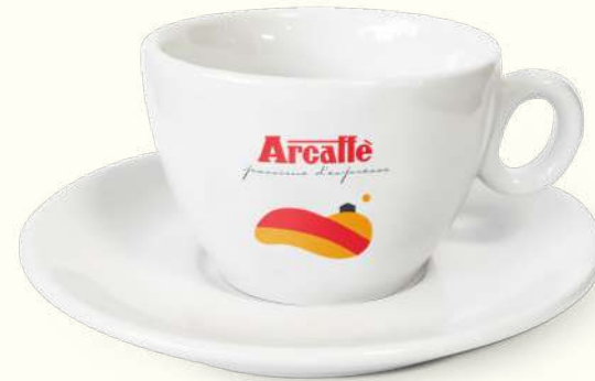
Cappuccino cup & saucer (175cc) JA1001