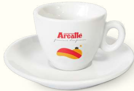
Espresso cup & saucer (80cc) JA1101