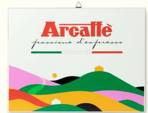
Arcaffè indoor logo sign (40x30 cm, plexiglass) JG1002