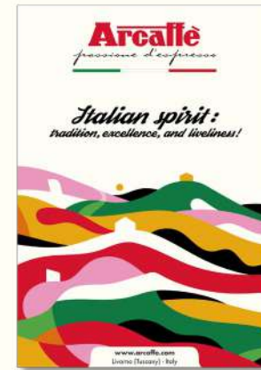
Arcaffè branded poster (50x70 cm, aluminum) JH1006